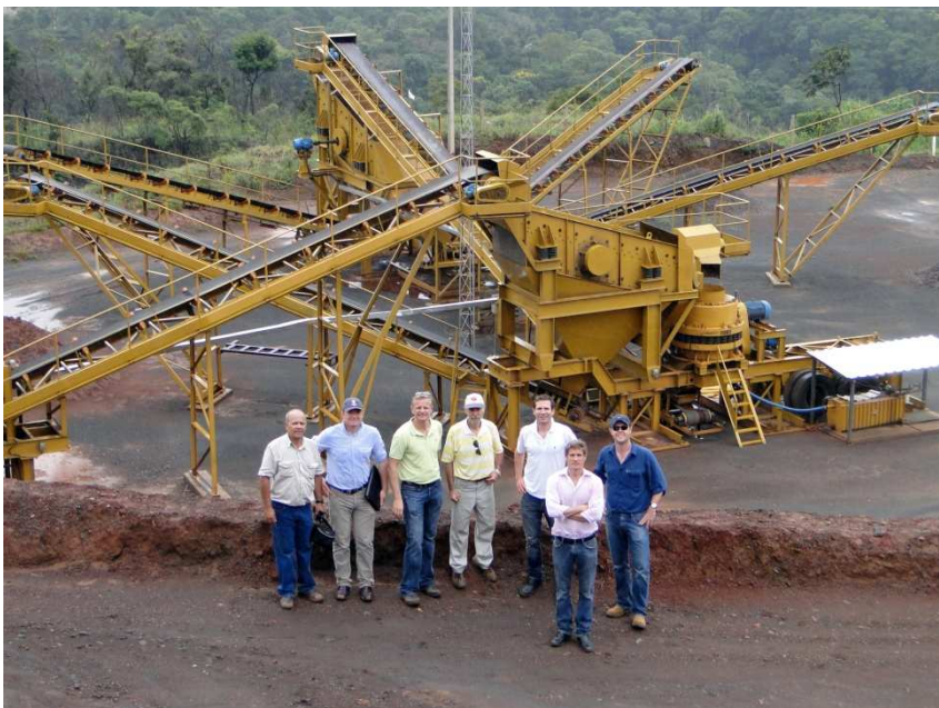
Figure 2: Crushing and Screening plant at Posse

There exists significant inherent value in Posse and once in production will provide substantial cashflow for Crusader. Yet the environmental approval remains a considerable risk. Until approval is received OML maintains its 75% discount to the $60 million valuation of Posse.