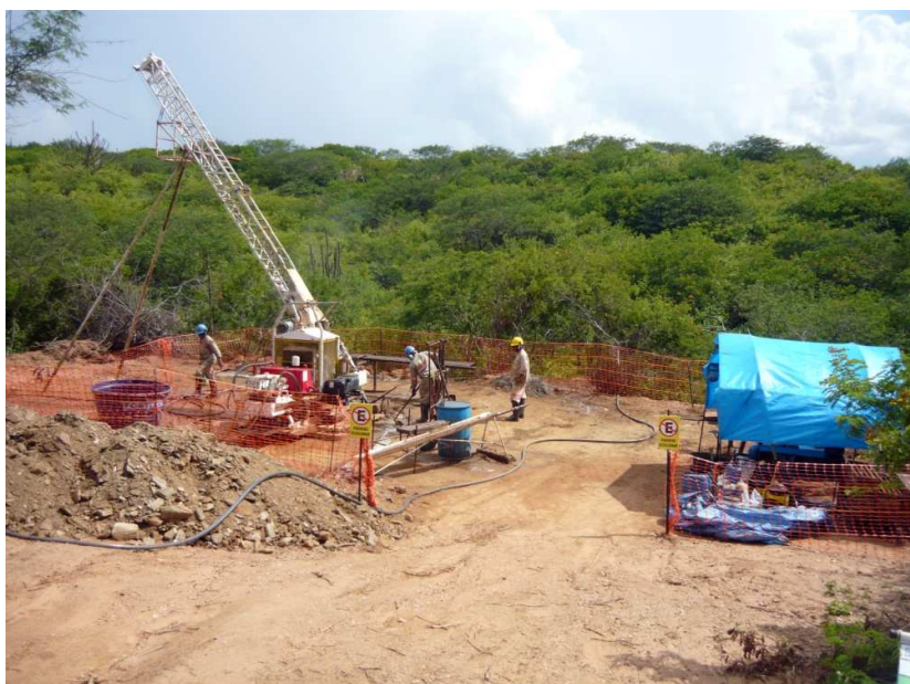
Figure 1: Drilling at Borborema

OML estimate the resource increase due in April may surprise on the upside with our revised estimate of 1.3 to 1.4 million ounces